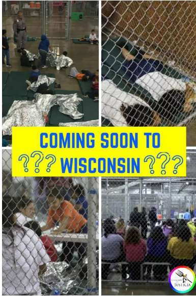
Flyer Labor Donated

Union Jobs, Public Ed. & Healthcare Not Cages! No Borders in the Workers' Struggle!