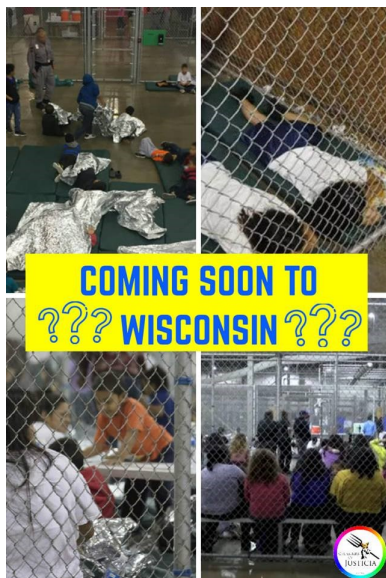
Flyer Labor Donated

Union Jobs, Public Ed. & Healthcare Not Cages! No Borders in the Workers' Struggle!